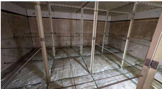
Pre clean of a cold water storage tank