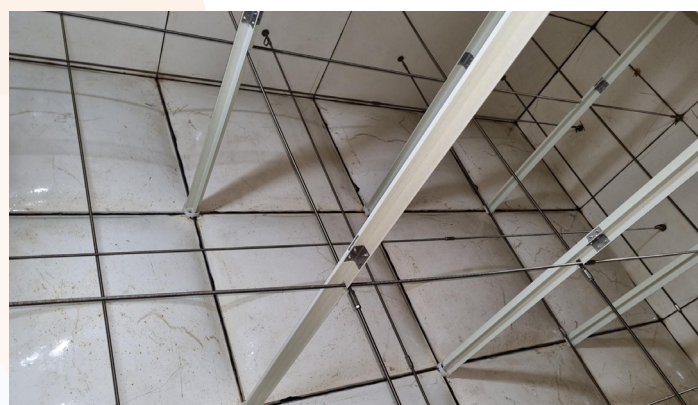
post clean and remedial works